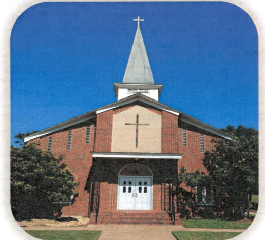
St. Thomas the Apostle Est. 1947

251 North Craft Highway Chickasaw, Alabama 36611