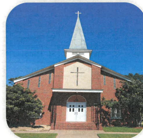
St. Thomas the Apostle Est. 1947

251 North Craft Highway Chickasaw, Alabama 36611