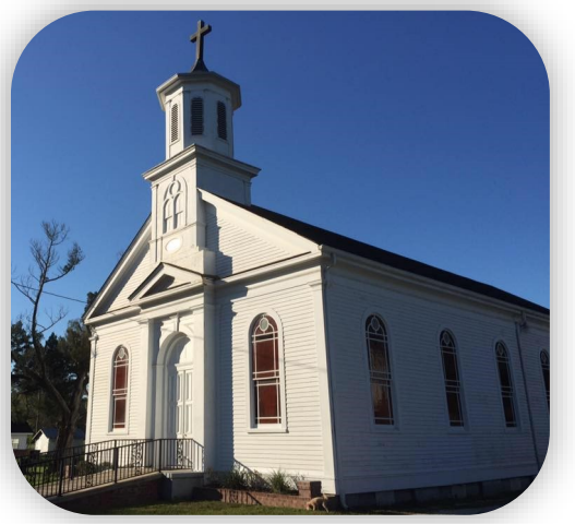
3625 West Main Street Whistler, Alabama 36612