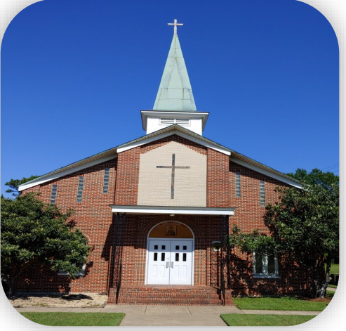
251 North Craft Highway Chickasaw, Alabama 36611

Email: office@stthomastheapostlecatholicchurch.com