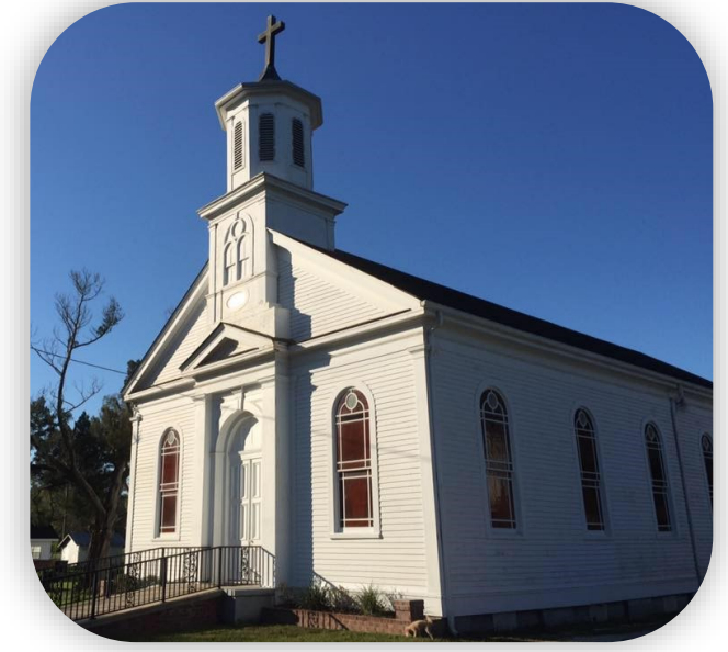
3625 West Main Street Whistler, Alabama 36612