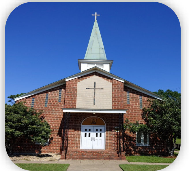
251 North Craft Highway Chickasaw, Alabama 36611

St. Thomas the Apostle Catholic Church Est. 1947