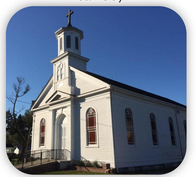
3625 West Main Street Whistler, Alabama 36612

St. Thomas the Apostle Catholic Church Est. 1947