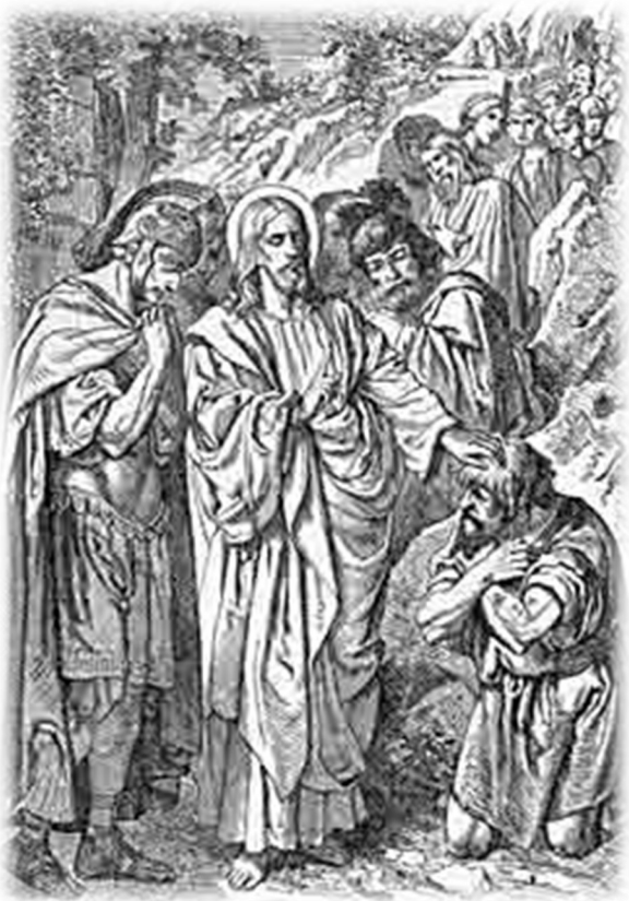
(Matt. VIII. 1-13)