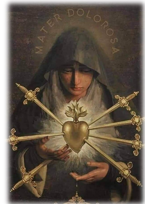
Our Lady of Sorrows Feast Day: September 15th