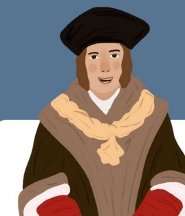
Saint Thomas More

St. Louis IX was more than just the king of France — he was also the father of eleven children! St. Louis took his responsibilities as a monarch seriously, and he saw his kingship as an opportunity to serve God.