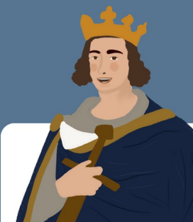
Saint Louis IX

Though he wished to enter religious life, he answered God's call to marriage and raised an extraordinarily holy family. All five of his daughters who survived to adulthood became nuns.