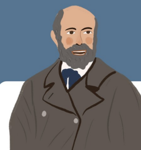
Saint Louis Martin

Though he wished to enter religious life, he answered God's call to marriage and raised an extraordinarily holy family. All five of his daughters who survived to adulthood became nuns.