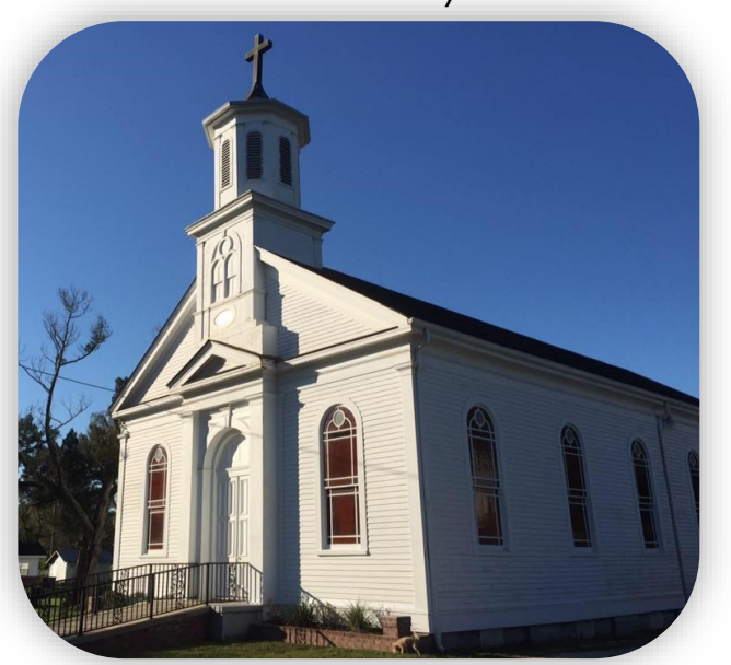
3625 West Main Street Whistler, Alabama 36612

St. Thomas the Apostle Catholic Church Est. 1947