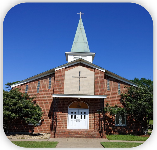
251 North Craft Highway Chickasaw, Alabama 36611

St. Thomas the Apostle Catholic Church Est. 1947