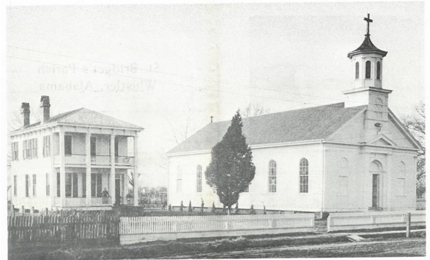
Whistler, Alabama Est. 1867