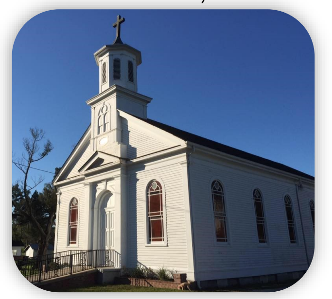
3625 West Main Street Whistler, Alabama 36612

St. Thomas the Apostle Catholic Church Est. 1947