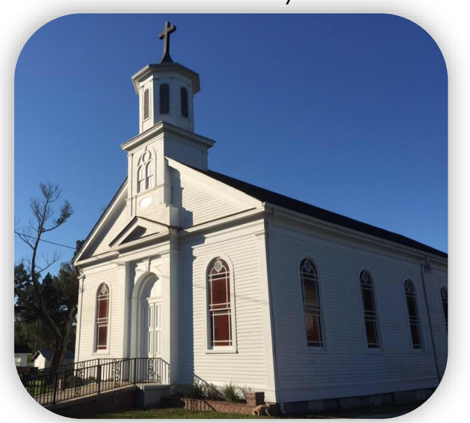
3625 West Main Street Whistler, Alabama 36612

St. Thomas the Apostle Catholic Church Est. 1947