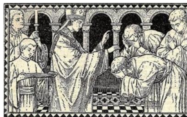
Meménto, homo, quia pulvis es, et in púlverem revertéris