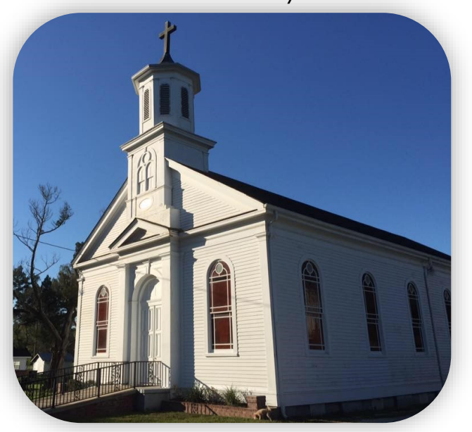
3625 West Main Street Whistler, Alabama 36612

St. Thomas the Apostle Catholic Church Est. 1947