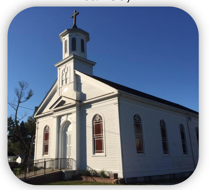
3625 West Main Street Whistler, Alabama 36612

St. Thomas the Apostle Catholic Church Est. 1947