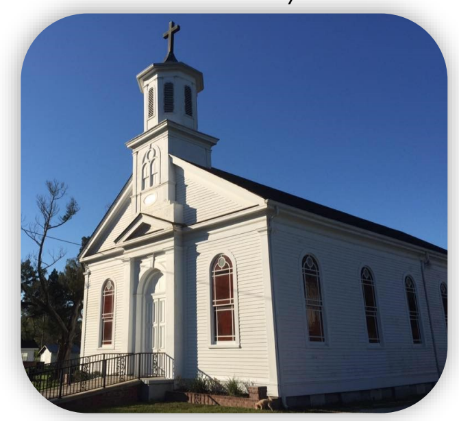
3625 West Main Street Whistler, Alabama 36612

St. Thomas the Apostle Catholic Church Est. 1947