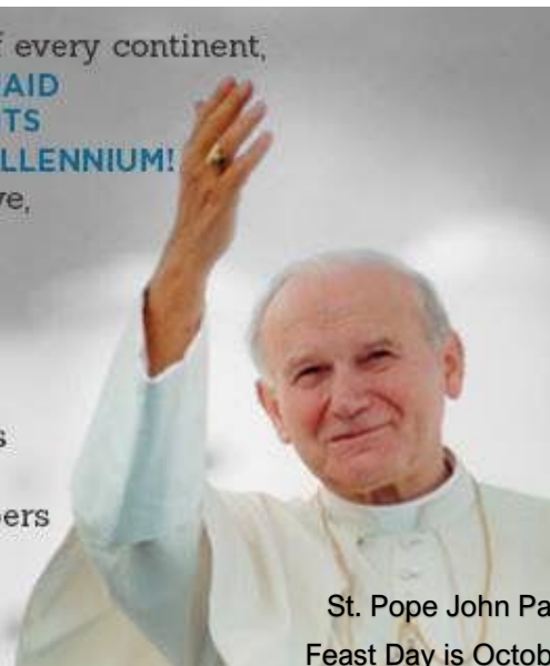
St. Pope John Paul II's Feast Day is October 22 nd

“Young people of every continent, DO NOT BE AFRAID TO BE THE SAINTS OF THE NEW MILLENNIUM! Be contemplative, love prayer, be coherent with your faith and generous in the service of your brothers and sisters, be active members of the Church and builders of peace.”